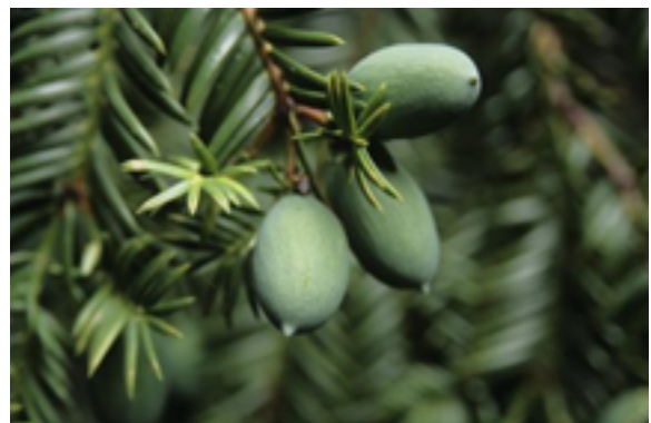
Fig. 8: Torreya nucifera