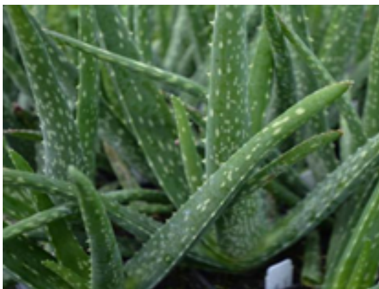
Fig. 5: Aloe barbadensis /Aloe vera