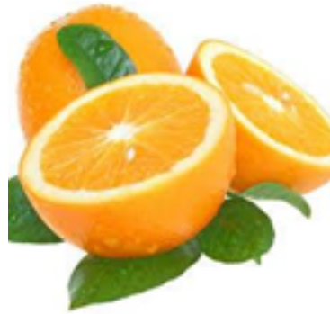
Fig. 6: Citrus aurantium /Orange peel