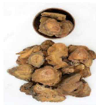
Fig. 2: Chinese Rhubarb extracts(rhubarb)

Numerous plant extracts possessing antiviral properties have been identified. However, most show strong in vitro activity in cell culture but, with lesser effectiveness during testing on infected animals. In addition, the molecular mechanisms tend to differ with different virus types. For example, the potential therapeutic target for SARS-CoV-2 is mostly in the expression of the ACE2 enzyme, inhibition of replication by influencing some ribosomal proteins, and by boosting the cytokine content of the immune system. Furthermore, some of the plants below are currently used in the testing phase to overcome SARS-CoV-2 infection.