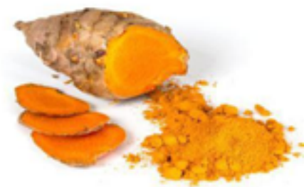
Fig. 9: Curcuma domestica L /turmeric