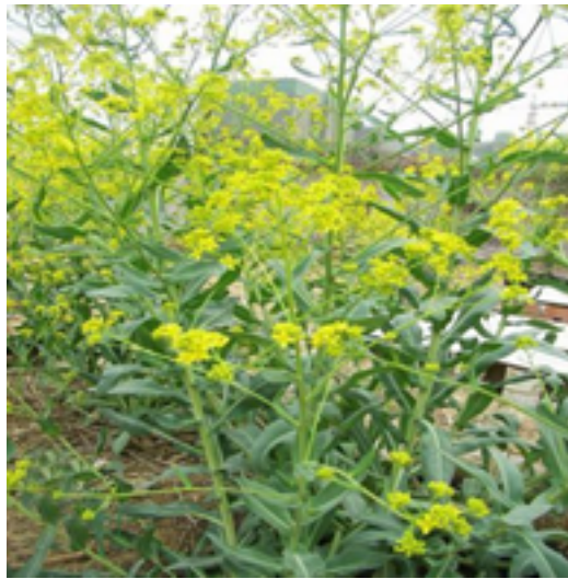
Fig. 4: Isatis indigotica