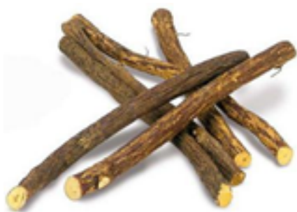
Fig. 10: Glycyrrhizae glabra