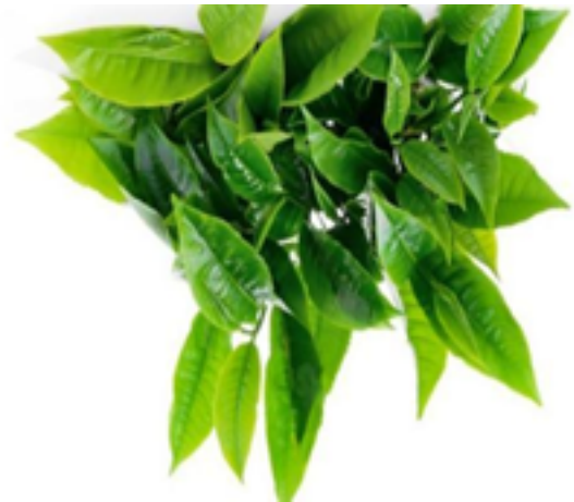
Fig. 7: Camelia sinensis /green tea