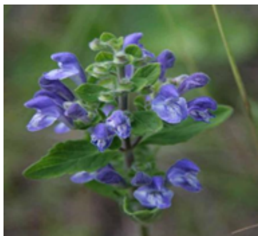
Fig. 11: Scutellaria lateriflora

effect on coronavirus and directly based on the genomic information and pathological characteristics of different coronaviruses to develop new targeted drugs from scratch.