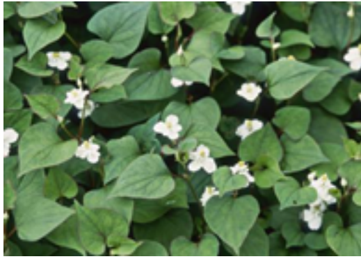
Fig. 3: Houttuynia cordata