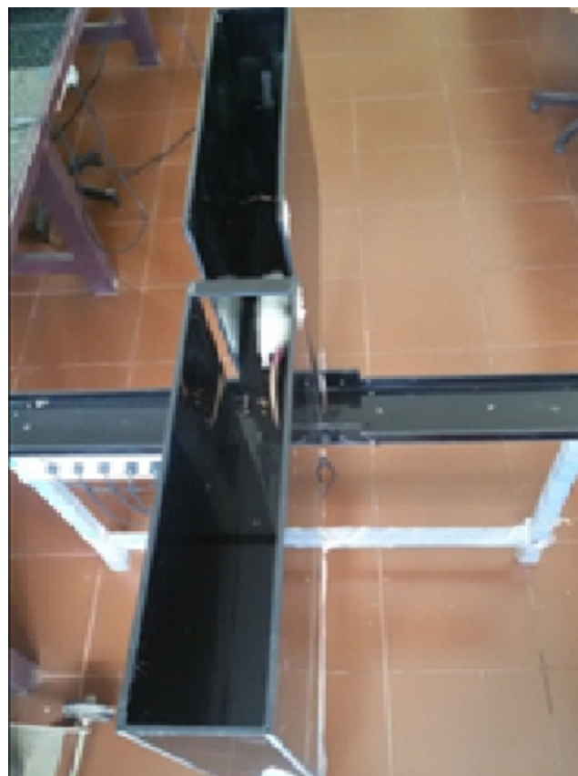
Fig. 1: Elevated plus maze

Elevated plus maze consists of two open arms measuring 50 x 10 cm, two closed arms measuring 50 x 10 x 40 cm and a central platform. Each rat was placed in the central platform facing one of the closed arms and observed for 5 minutes as shown in Figure 1. Time spent in open and closed arms were noted 11 . Anxiolytic activity was expressed by increase in time spent in open arm.