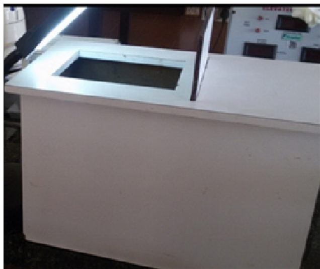
Fig. 2: Light dark arena