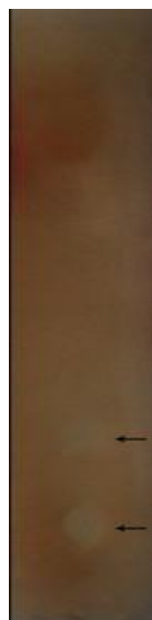
Fig. 2: TLC bio autography analysis of crude extract from ICN 698 against Enterobacter sp. Zones of inhibition shows the active spots with Rf values 0.11 and 0.29 respectively