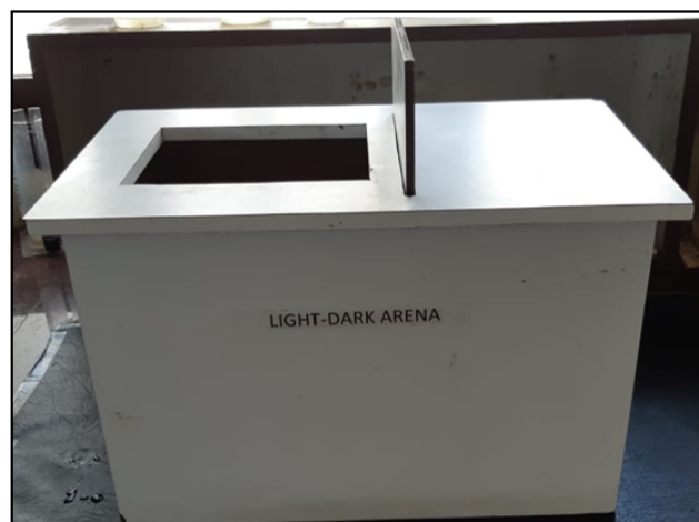
Fig. 3: The light dark arena