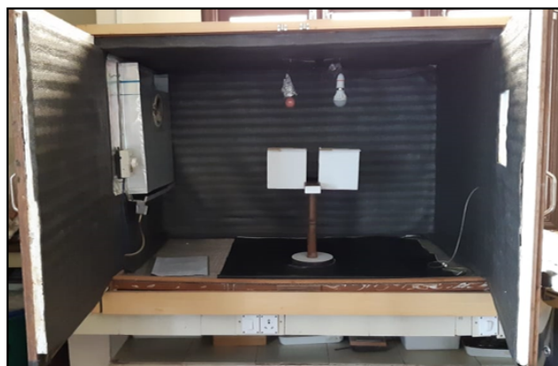
Fig. 1: The etho-chamber used for the experiments