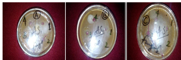
Fig. 2: Petri plates showing zone of inhibition

Present research reported the presence of phenolic compounds, glycosides, tannins, carbohydrates, proteins, amino acids, tannins, reducing suger, non-reducing suger and inorganic compounds such as calcium, magnesium, iron, carbonate & sulphates by preliminary phytochemical analysis. Plants containing phenolic compounds possess good antioxidant properties. Therefore Brassica rapa may also possess activity against a panel of fungus responsible for the most common fungal diseases like many other antifungal drugs.