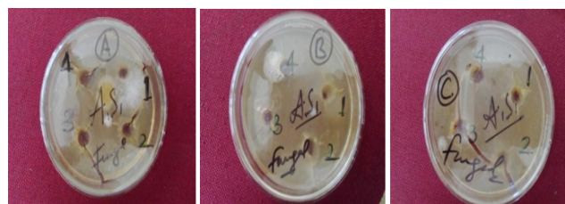
Fig. 3: Petri plates showing zone of inhibition.