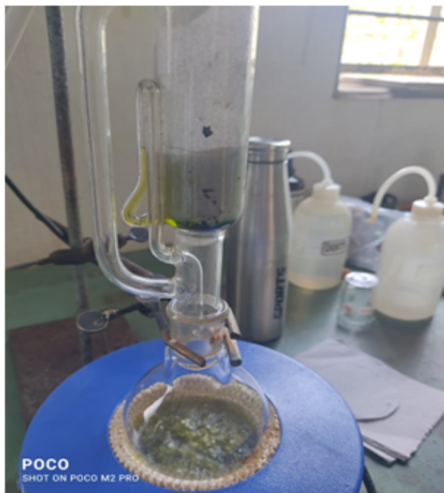
Fig. 1: Extraction of Algae.

8gm of powdered material mixed with 150ml acetone and Soxhlet extraction process was carried out at temp 51 0 C for 4-5hrs.